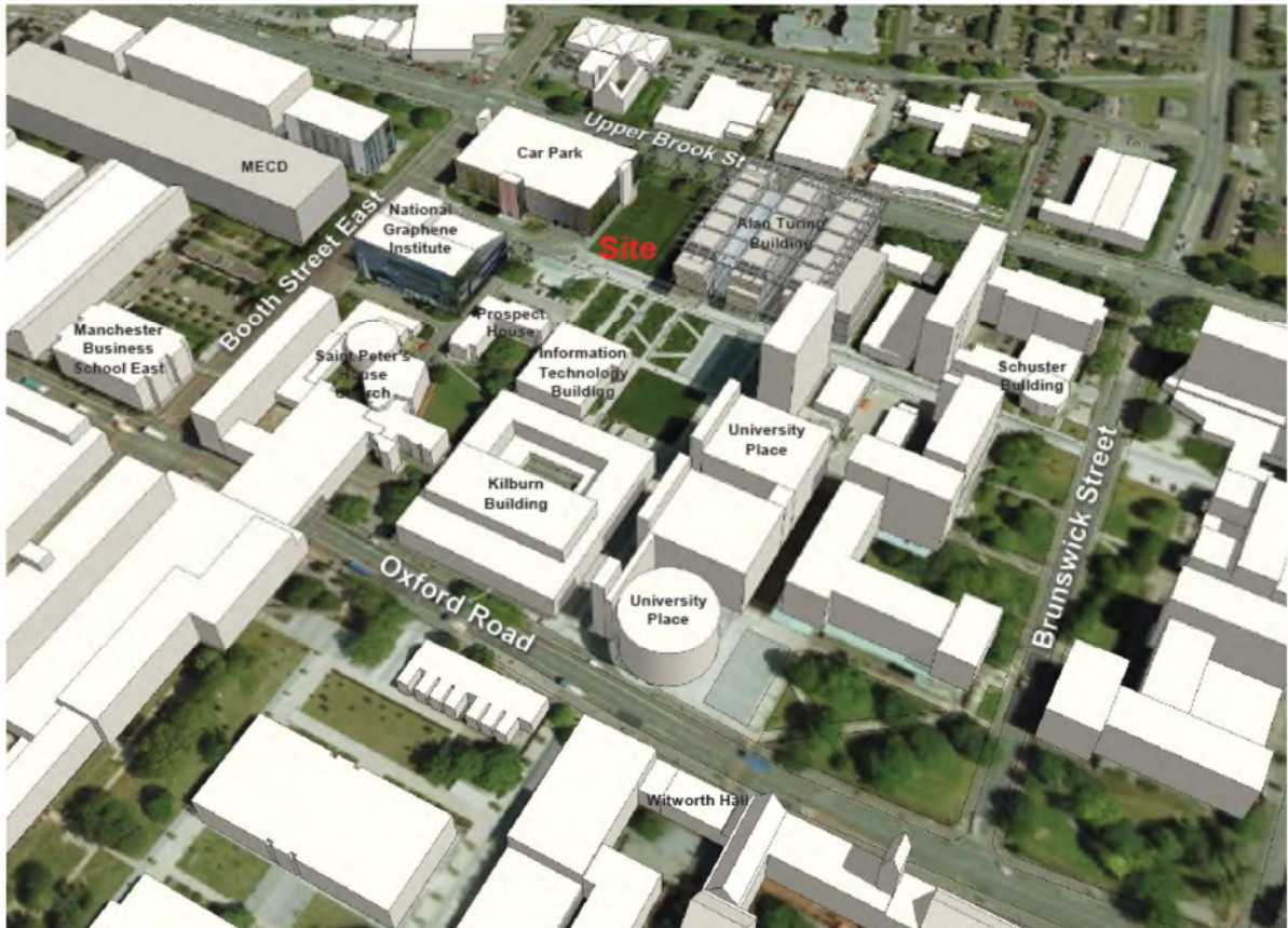
Context illustration with Royce Institute site identified

The landscape materials would accord with the University of Manchester Landscape Masterplan (2013). There are a number of trees on site of varying quality and value, some of which would be removed to accommodate the new building. Where possible, trees are retained and enhanced with a more diverse planting matrix.